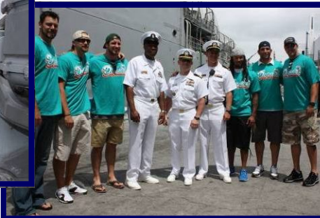
The Miami Dolphins came for a tour of Gettysburg while in Fort Lauderdale.