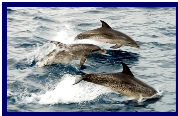
Left: SN Lopez and FC3 Koya show their ability to fight through the pain of OC Spray to defend themselves. Above: Several dolphins playing off of the bow.