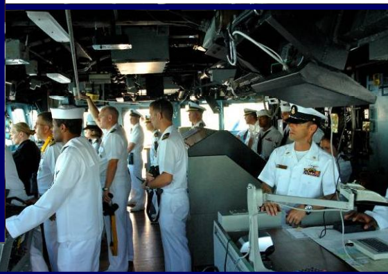
The bridge team safely pulls Gettysburg into Port Everglades, FL.