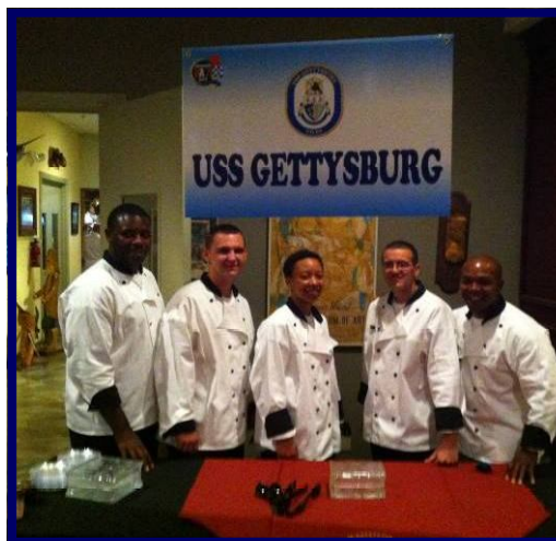
Gettysburg's "Galley Wars" team stands proudly at their set up table.